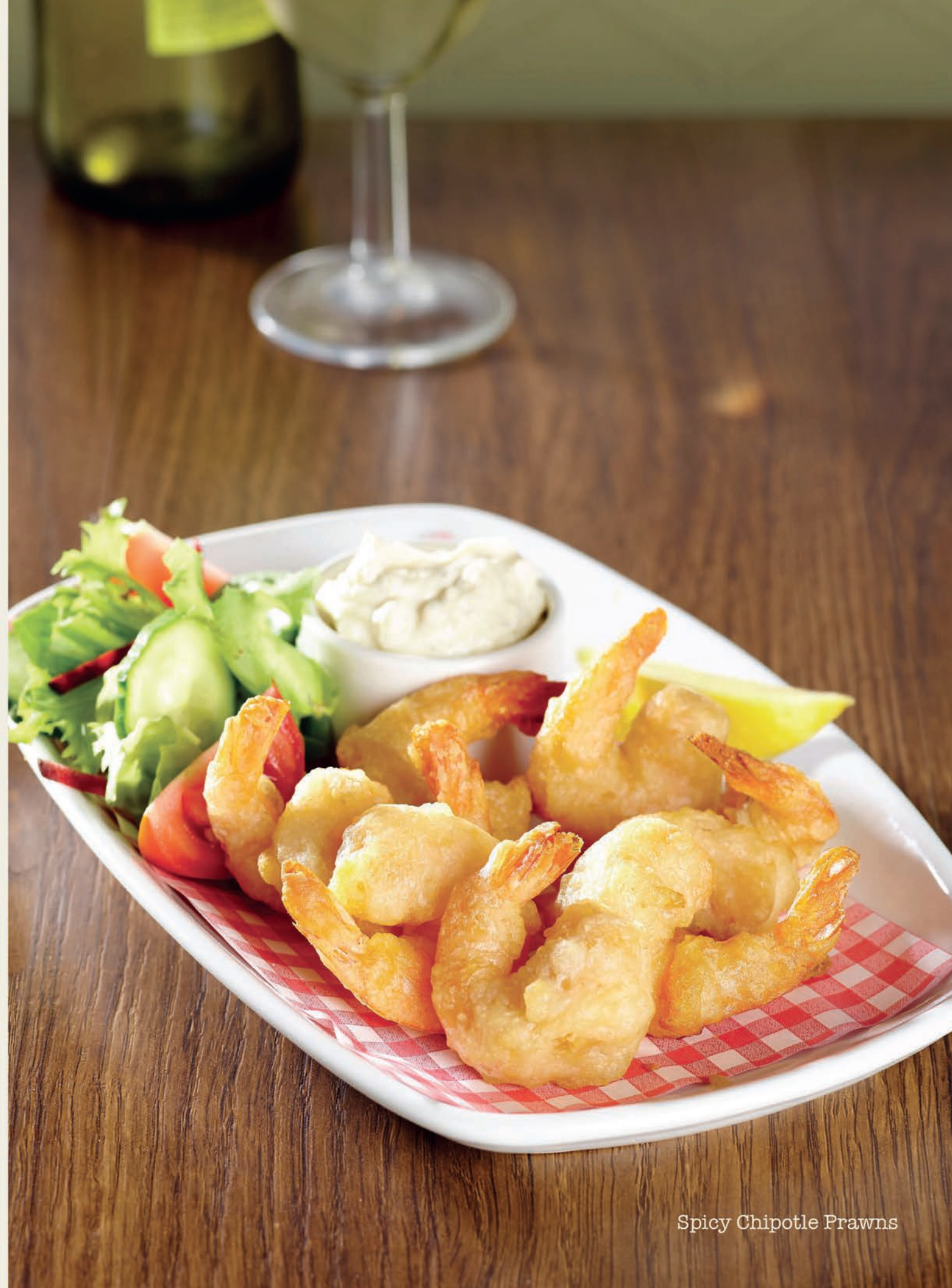
Spicy Chipotle Prawns

BEFORE ORDERING FOOD OR DRINK PLEASE SPEAK TO ONE OF OUR TEAM IF YOU REQUIRE INFORMATION ON FOOD ALLERGENS.