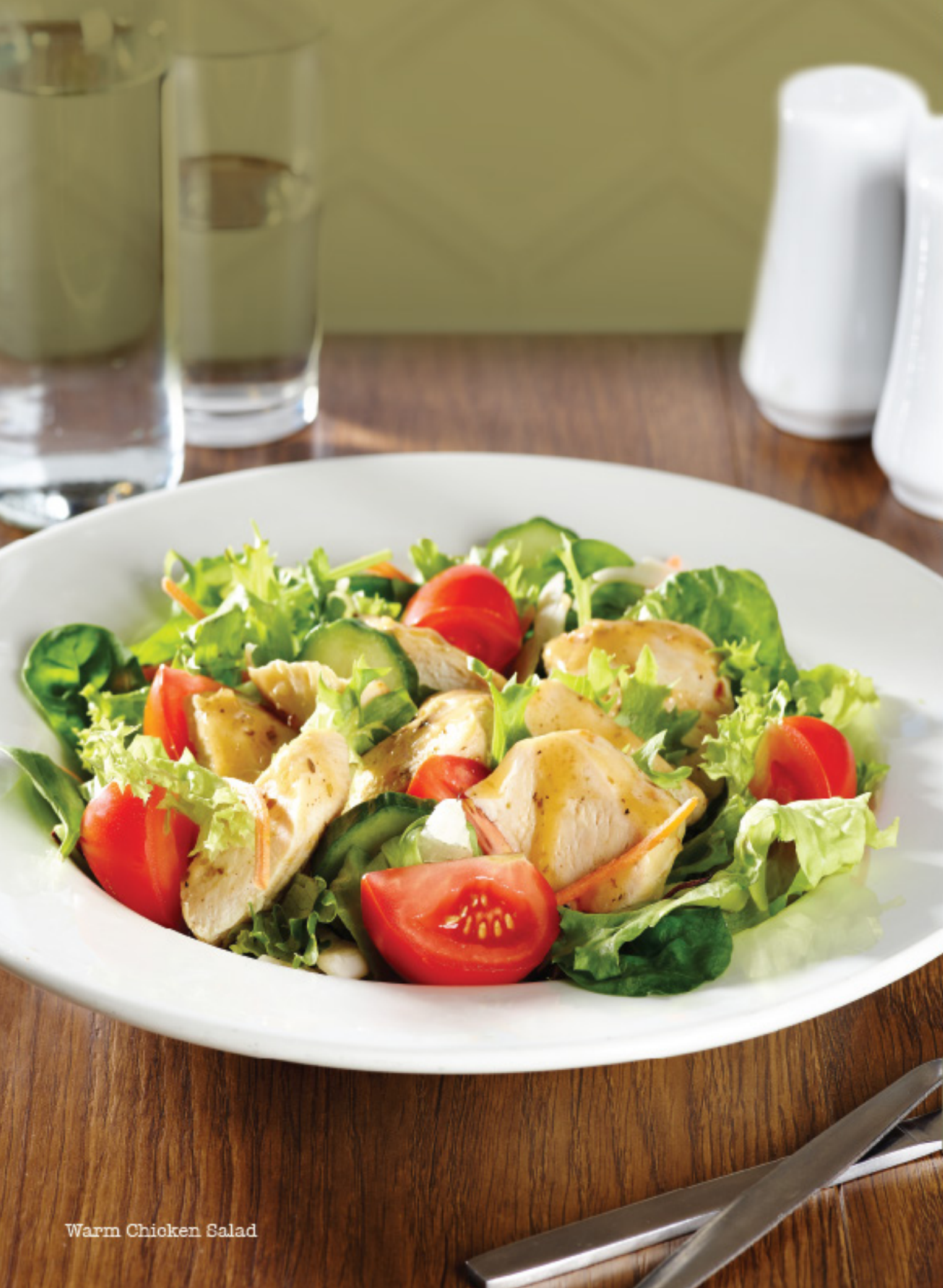
Warm Chicken Salad